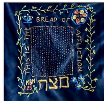
Photo: Grant, Megan, Rabbi Eva Megan is holding the matzo cover she created - shown in photo to the right.